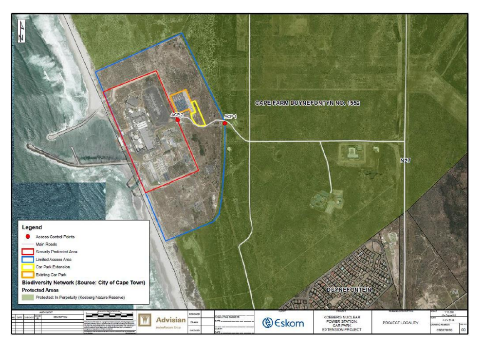
Figure 2: Site locality within Koeberg Nuclear Power Station.