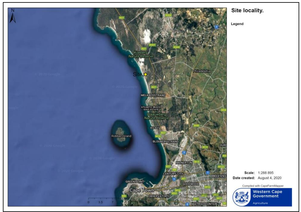
Figure 1: Locality of Koeberg Nuclear Power Station (site).

Cape Farm Duynefontein No 1552, portion 0